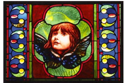
St. Joseph of Arimathea Christmas Card 2008